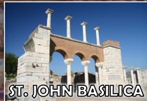
ST. JOHN BASILICA